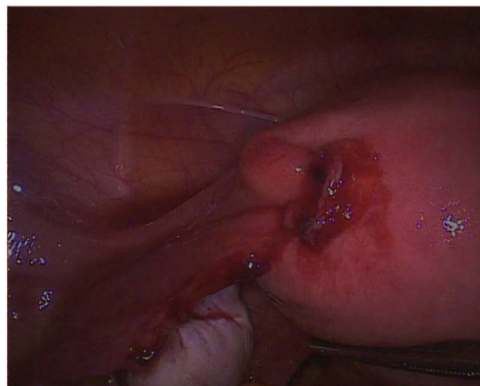
Fig. 2. Laparoscopic view of the incarcerated fallopian tube.

Vacuum aspiration for pregnancy termination has been demonstrated to be effective (>99% efficacy rate) and safe, with major complications occurring in approximately 0.5% of patients. Uterine perforation is frequently asymptomatic—in the present case it was